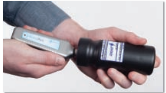
Easy calibration process

Acoustic Calibrator Kit cases NoisePen fixings Mains Power Supply